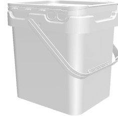
Super Kube 2