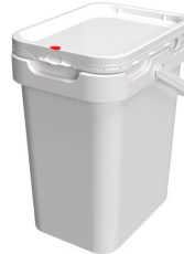
Super Kube 3