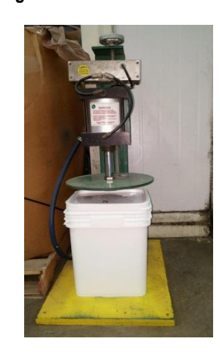
Figure B: Pneumatic Press

d. Inspect lid after application to confirm it is properly seated.